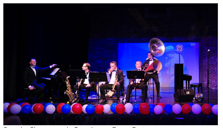
Saturday Showcase at the Powerhouse - Corpse Revivers