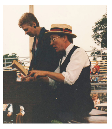
In 1986, the contest took place on a semi-truck flatbed with a canvas tarp over the top to protect contestants from incremental mists that day.