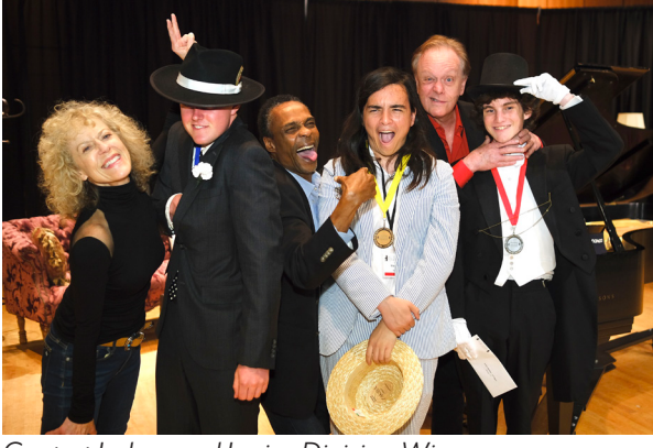
Contest Judges and Junior Division Winners