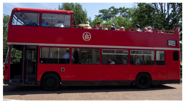
Double Decker Bus Tour, 2017