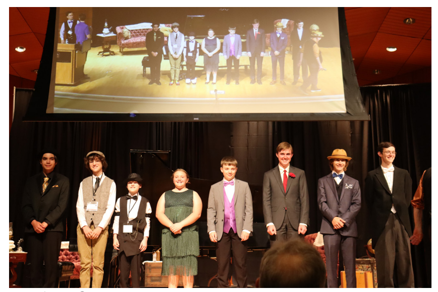
2022 Junior Competitors