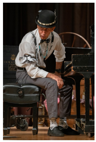
Four Arrows, 2019