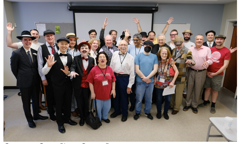
Contestant Group Photo: Contest Draw